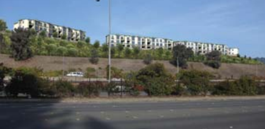
Viewpoint 6 - Five years post construction - approved project (2012 EIR) Renderings show the view from Mt. Diablo Boulevard.